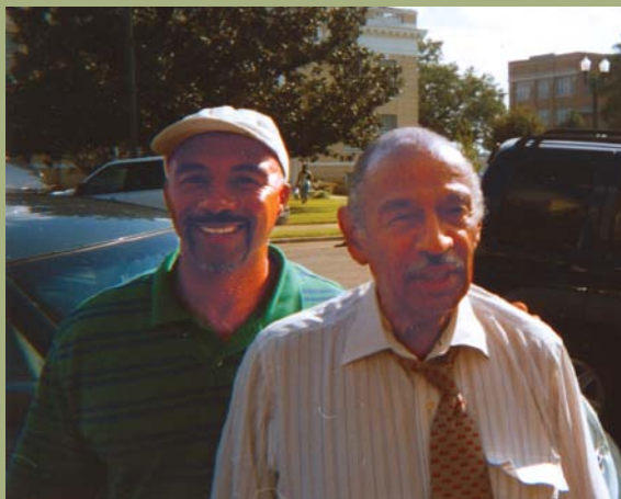
Senator John Conyers of the House Judiciary Committee

Minister Tony Parker regularly meets with lawmakers regarding prisoners re-entry and other restorative justice acts.