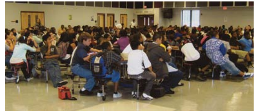
Students attending the anti-gang campaign

outstanding preacher/teacher, revivalist, motivational speaker, community leader, author and radio/internet broadcaster, he remains fully committed to assisting former inmates with a successful reentry. His work in registering ex-offenders to vote, gang awareness and youth leadership conferences have gained the watchful eye of local and state