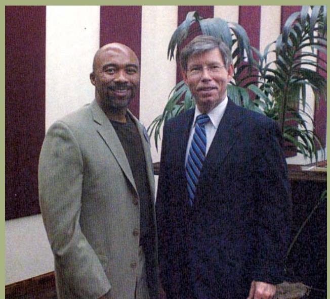
Attorney General Bill McCollum of Florida.