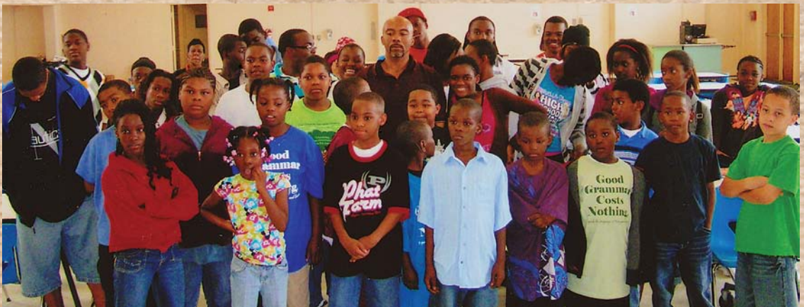
Children with promise