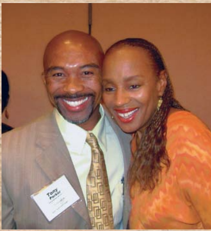
Tony Parker with Susan L. Taylor, Founder, National CARES Mentoring Movement and Editor-in-Chief Emeritus of Essence Magazine.